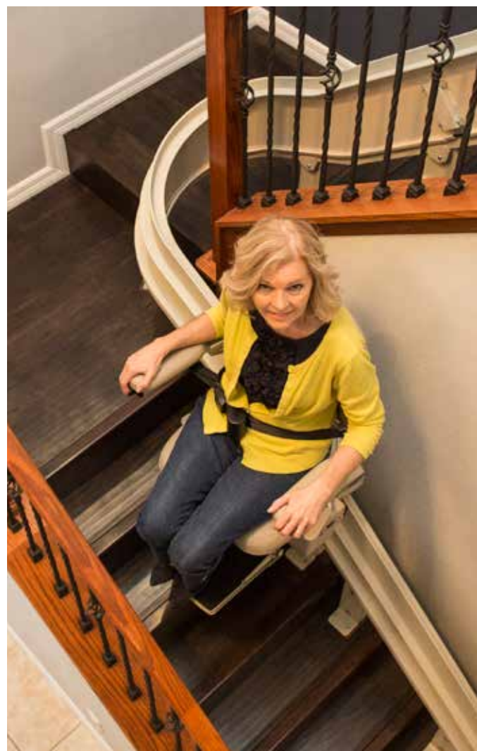
Crafted for a precision fit around curves.