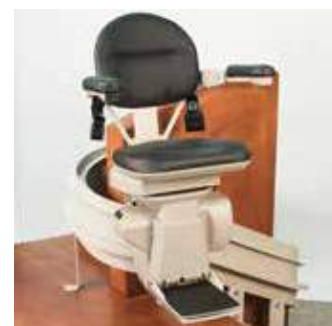
Mid-park and charge station for staircases with middle landings.