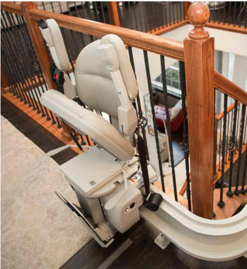
Custom made specifically for your home.