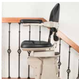
Power swivel sea. Control on chair armrest or wireless call/send.