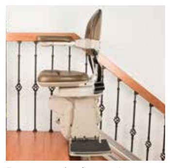
Power swivel seat for effortless exit. Controlled on chair arm or wireless call/send.