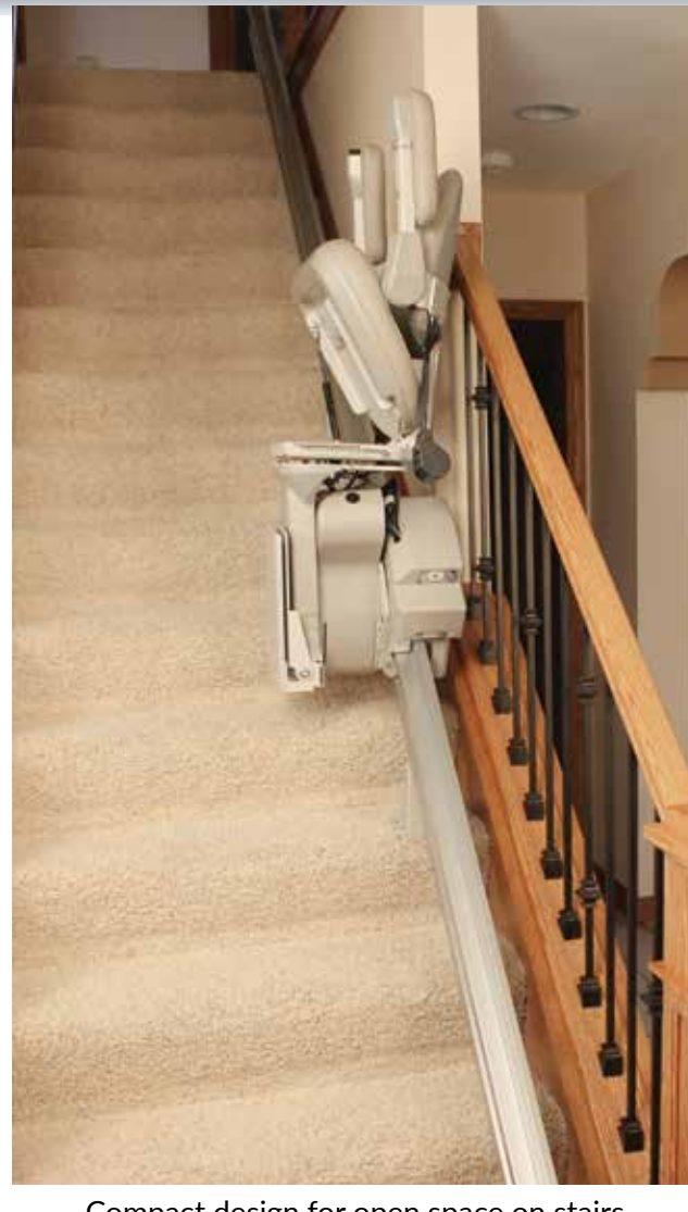
Compact design for open space on stairs.