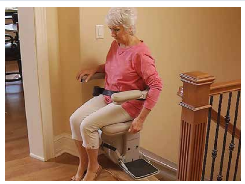
Offset swivel seat makes it easy to get on/off.