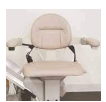
Larger seat and/or footrest for increased comfort.