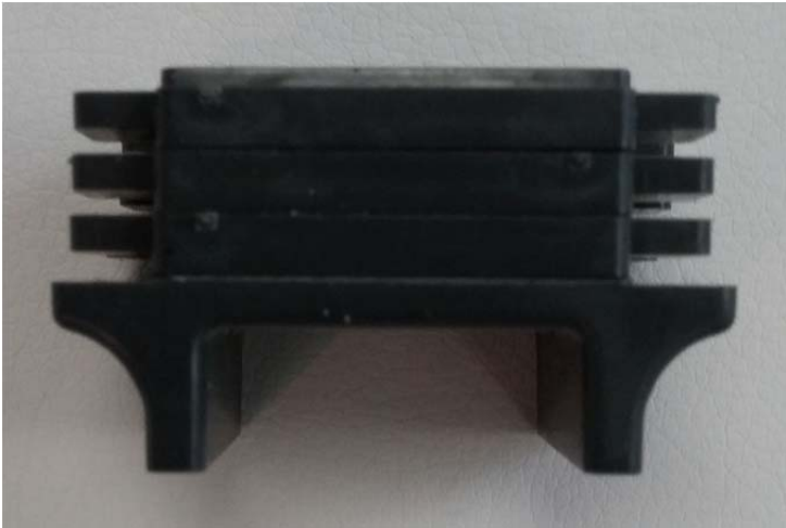
GLUED TOGETHER W/PVC GLUE