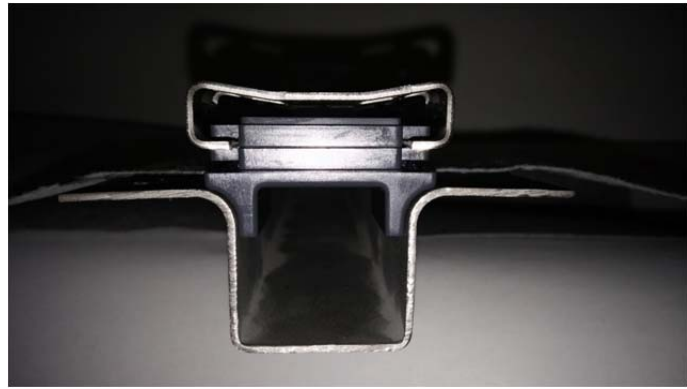
COSMO COVER W/SPACER