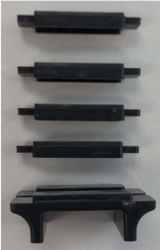
READY TO ASSEMBLE