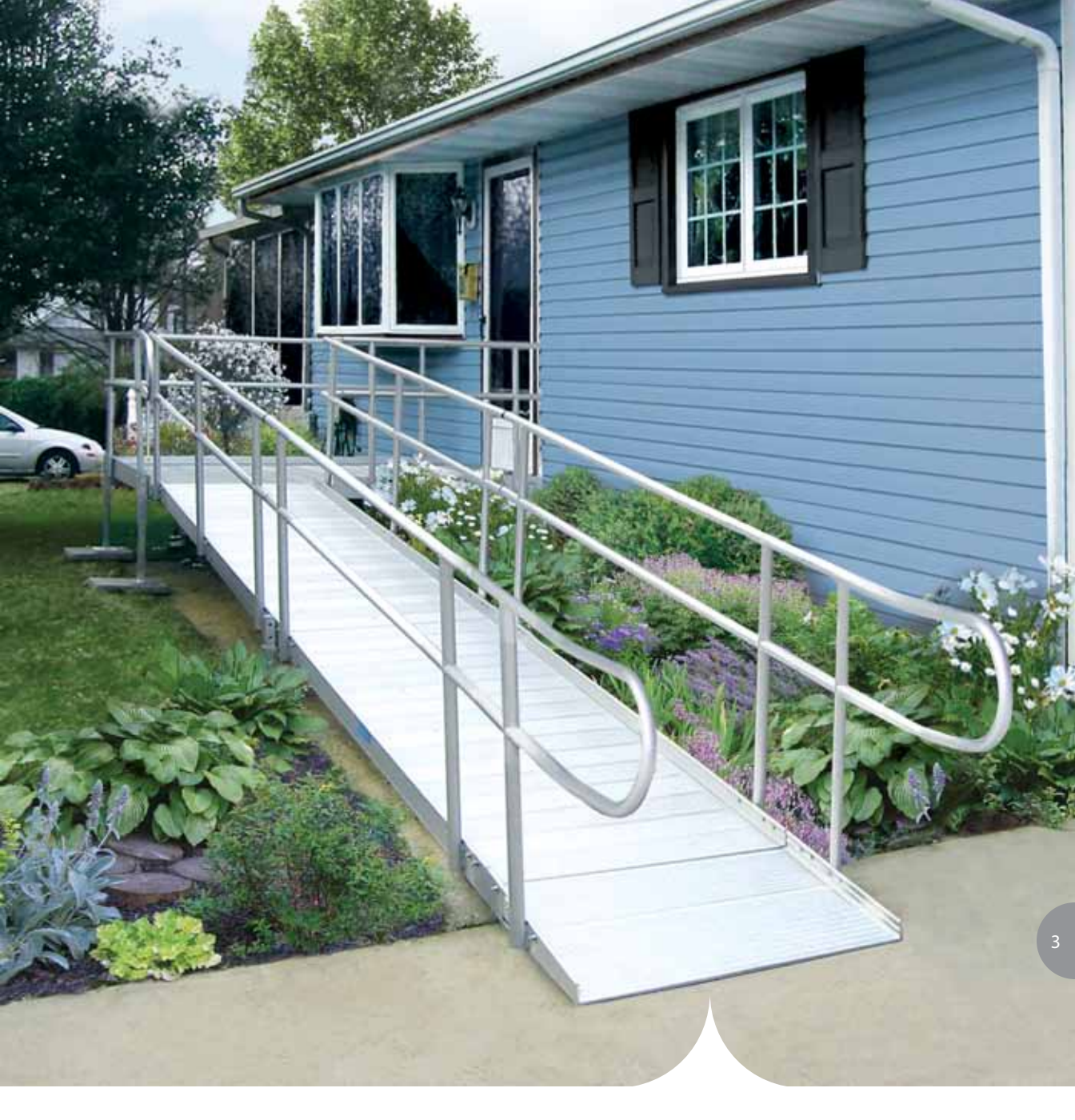
WE MAKE IT LAST