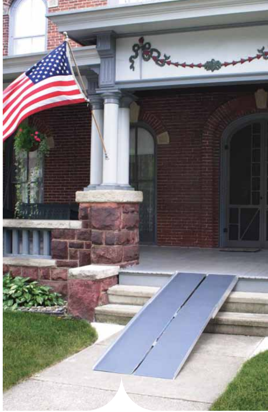
WE MAKE IT PORTABLE