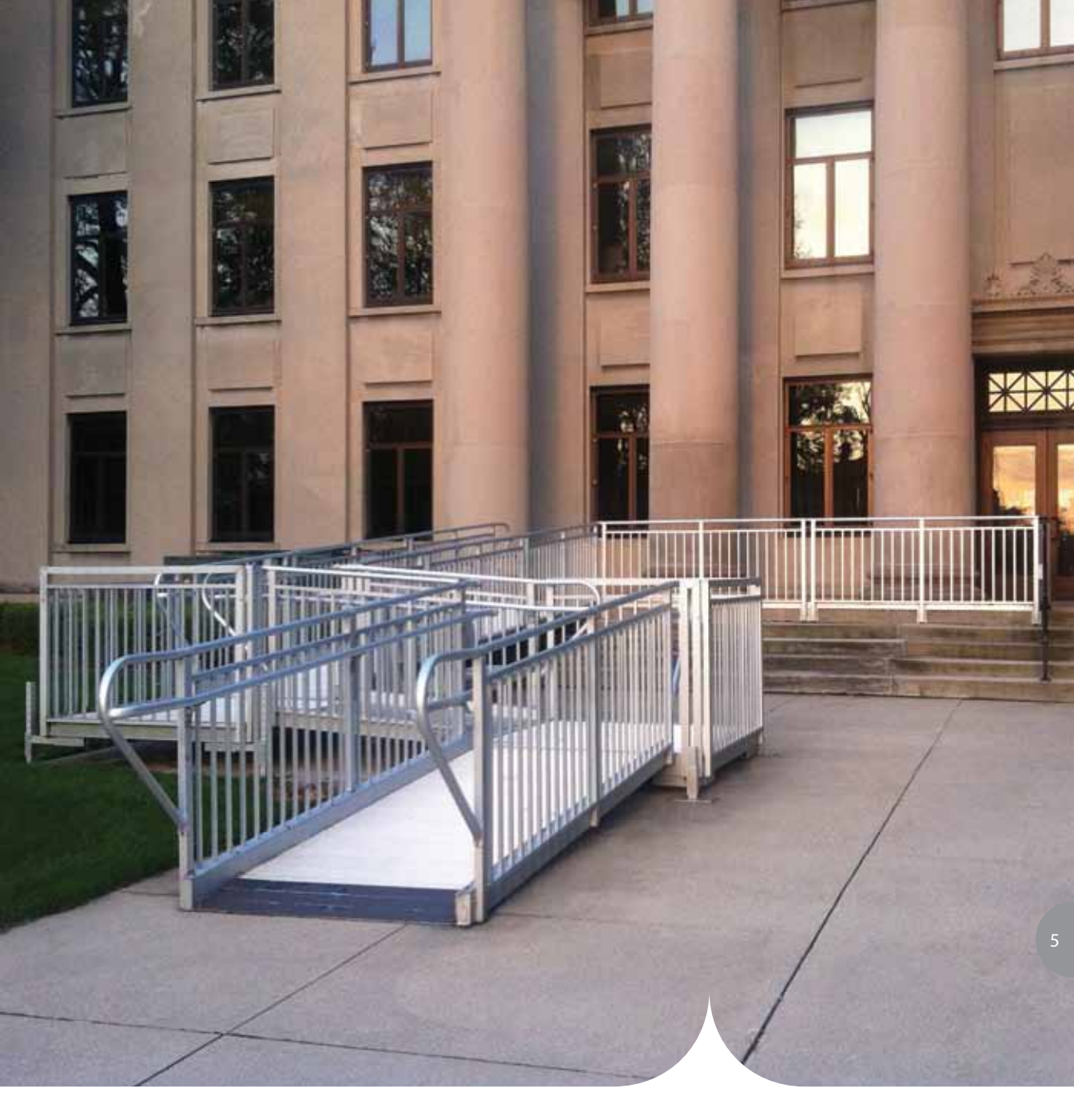
WE MAKE IT COMPLIANT